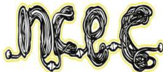
Nundah Community Enterprise Co-Operative

Nundah Community Enterprises Cooperative (NCEC) provides meaningful work for people with intellectual disabilities who were long-term unemployed, having fallen through gaps in the employment system. This is achieved through the establishment of employment generating businesses. NCEC measures its performance by the sustainability of its businesses (Espresso Train Café and NCEC Parks and Maintenance) and the quantity, quality and longevity of employment it creates. NCEC adopts a depth approach to social impact, creating employment for those whom the private market and funded government programs had been unable to assist. Our leadership in the sector was this year confirmed in