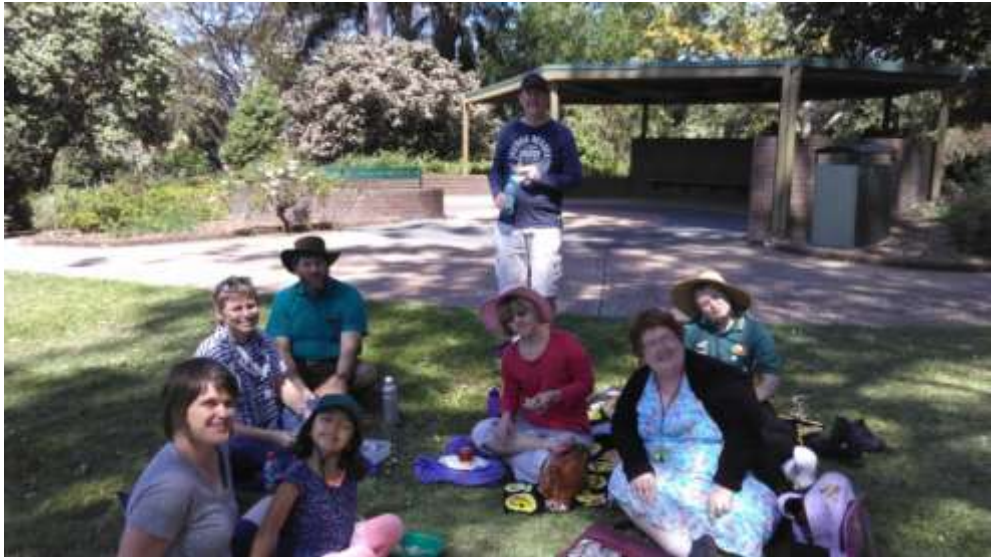
A recent outing to the Planetarium at Mount Coo-tha